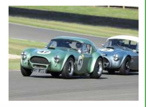
Eligible car list:

Cars may be fitted with working front and rear lights.